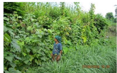
Cultivation of legumes as forage crop