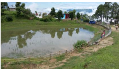
Road water harvesting pond for groundwater recharge, Dailekh

Under a bilateral agreement between the Governments of Nepal and Switzerland (SDC), Helvetas has long provided technical support for trail bridge construction across the country. Trail bridge designs are now being adapted to the heightened risk of flooding and bank erosion. This includes micro piles foundations in Terai and river training measures to protect bridge foundations.