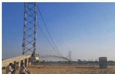
Danav khola trail bridge towers on pile foundation